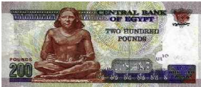
Currency - Egyptian Pound